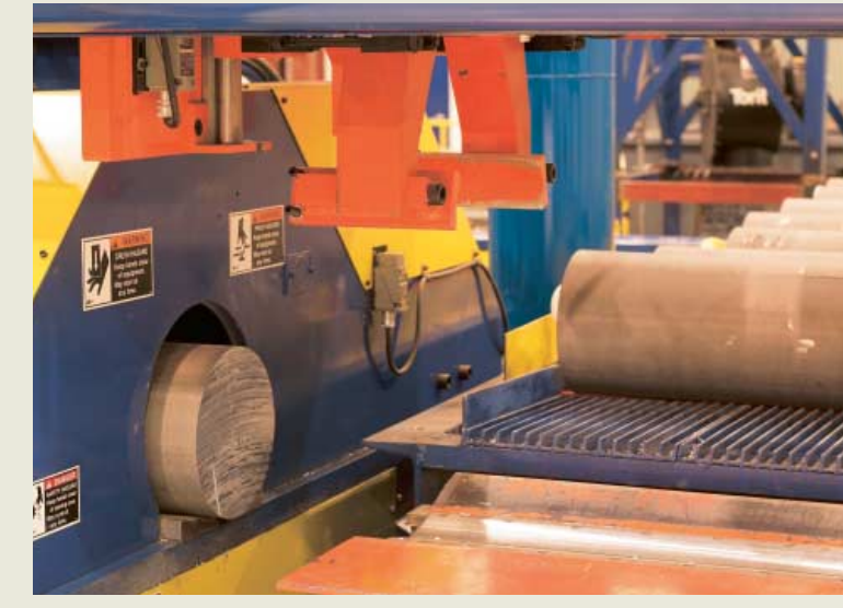
Granco Clark's Billet Saw delivers a clean, square cut.

Granco Clark Billet Sawing Systems integrate the rugged saw with a PLC processor and loading and unloading tables.